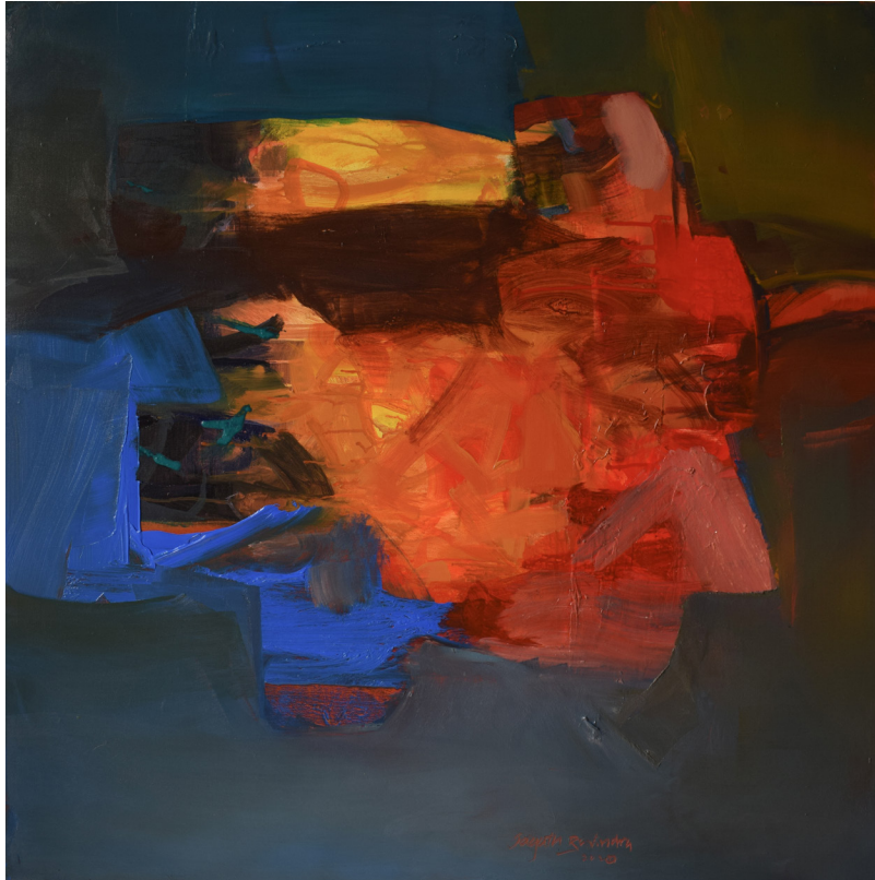
Time, Mind and Space XIV , 2020, Acrylic on canvas, 91.5cm x 91.5cm