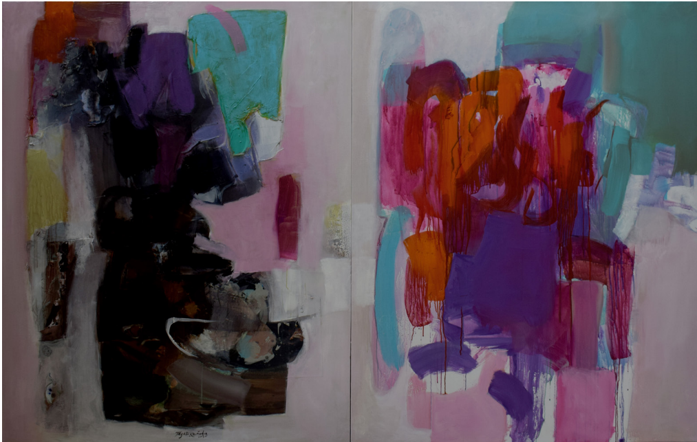
Time, Mind and Space V , 2020, Acrylic on canvas, 152cm x 245cm