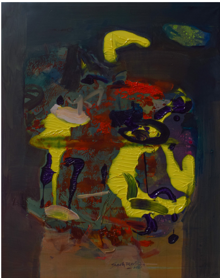
Time, Mind and Space XIII , 2020, Acrylic on canvas, 95cm x 76cm