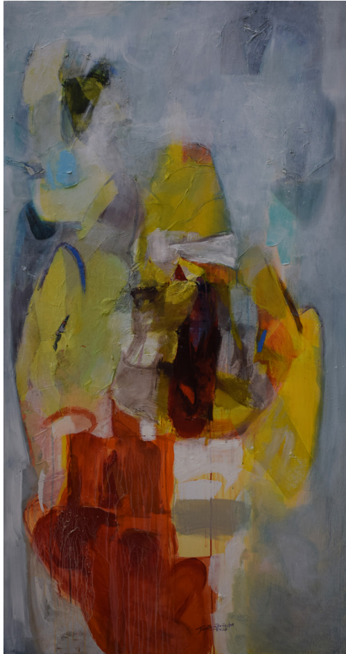
Time, Mind and Space VI , 2020, Mix Media on canvas, 174cm x 92cm