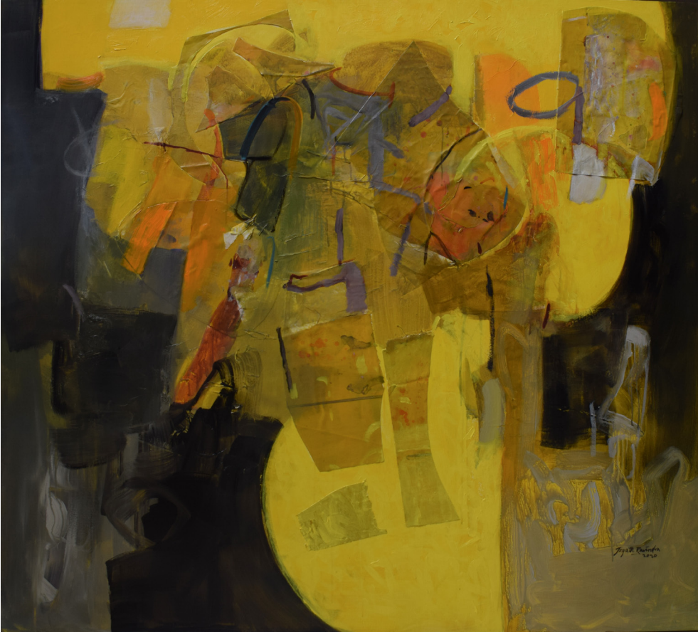
Time, Mind and Space IV , 2020, Acrylic on canvas, 153cm x 172cm