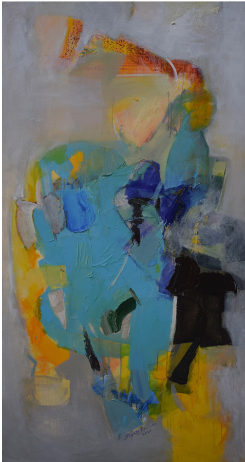
Time, Mind and Space VIII , 2020, Mix Media on canvas, 174cm x 92cm