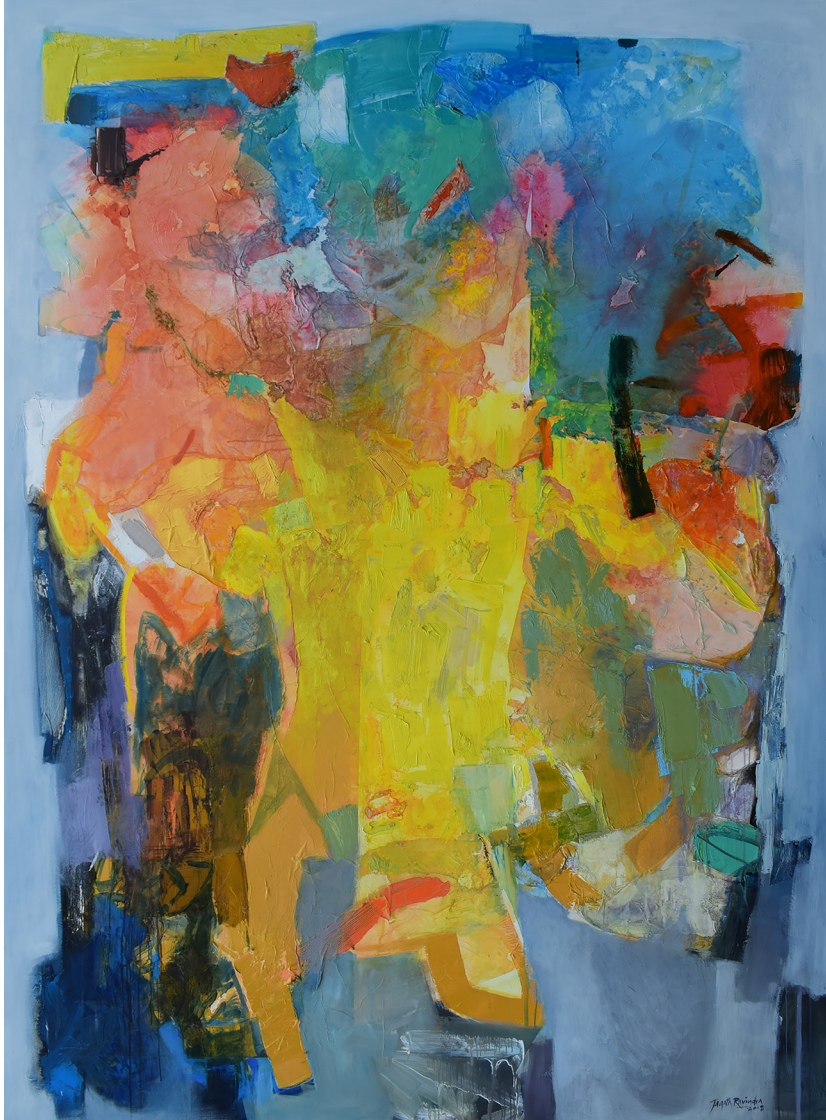
Time, Mind and Space I , 2020, Mix Media on canvas, 288.5cm x 209cm