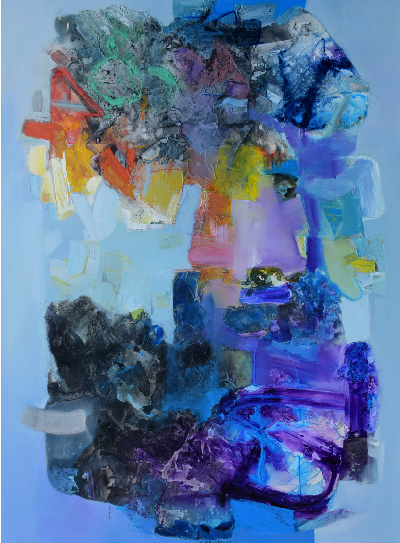
Time, Mind and Space II , 2020, Mix Media on canvas, 289cm x 205cm