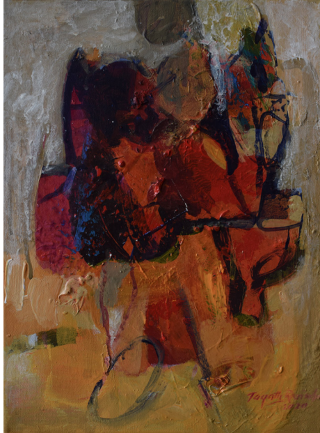
Time, Mind and Space X, 2020, Acrylic on canvas, 40cm x 30cm