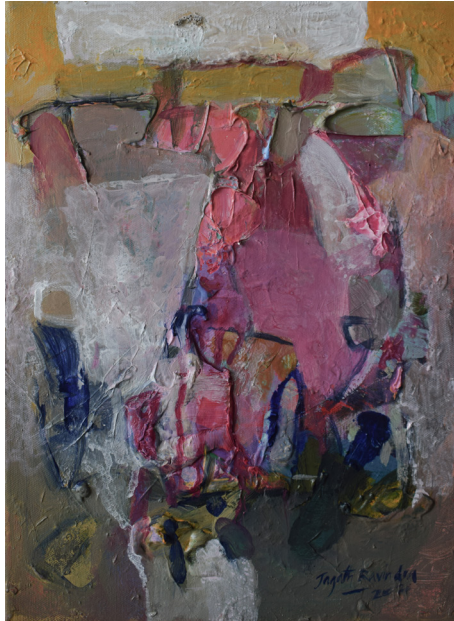
Time, Mind and Space IX , 2020, Acrylic on canvas, 40cm x 30cm