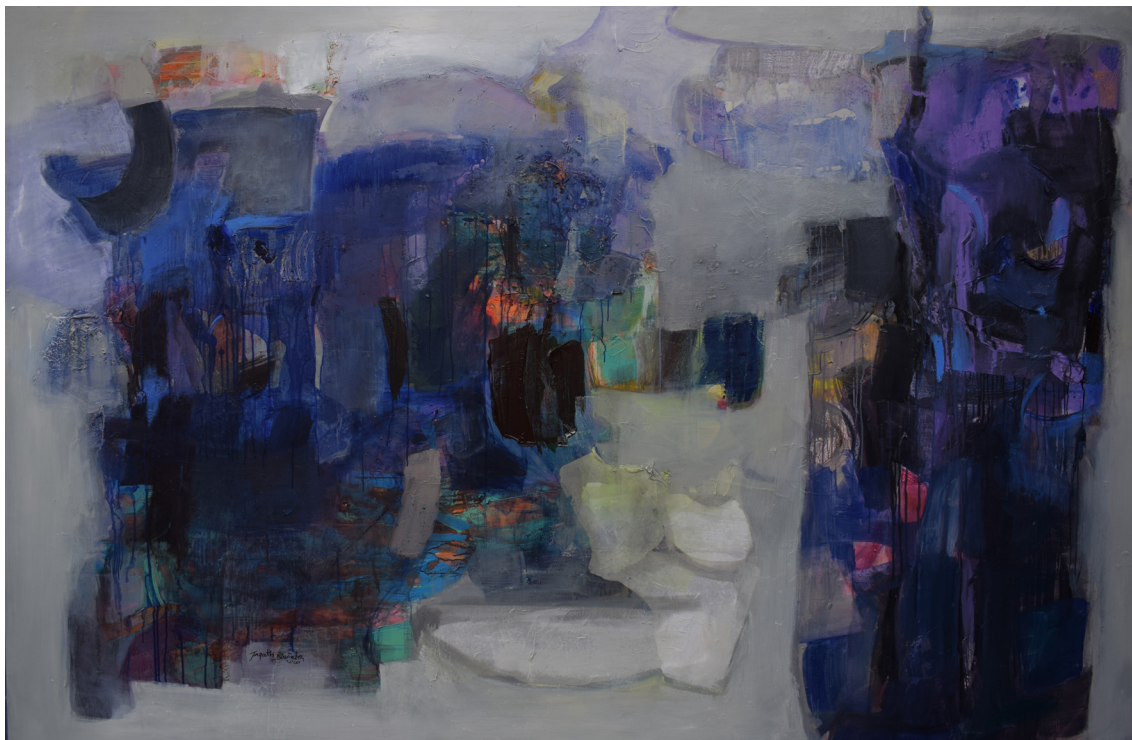
Time, Mind and Space III , 2020, Mix Media on canvas, 183cm x 288cm