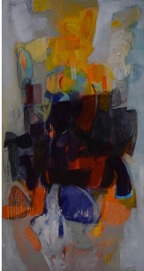
Time, Mind and Space VII , 2020, Mix Media on canvas, 174cm x 92cm