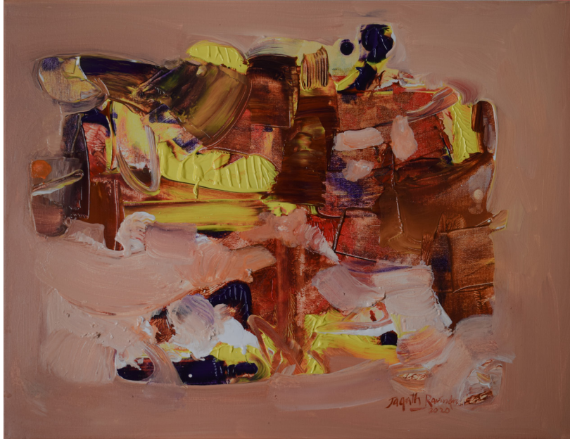
Time, Mind and Space XI, 2020, Acrylic on canvas, 60cm x 80cm