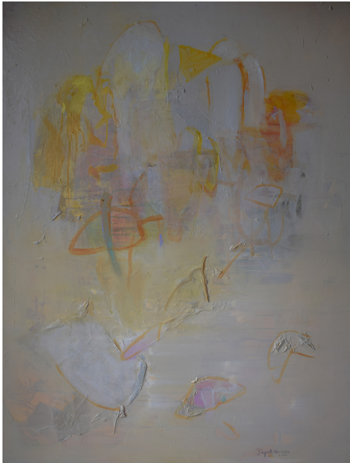
Time, Mind and Space XII , 2020, Acrylic on canvas, 120cm x 90cm